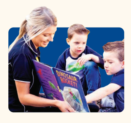
Practice Partners in all states